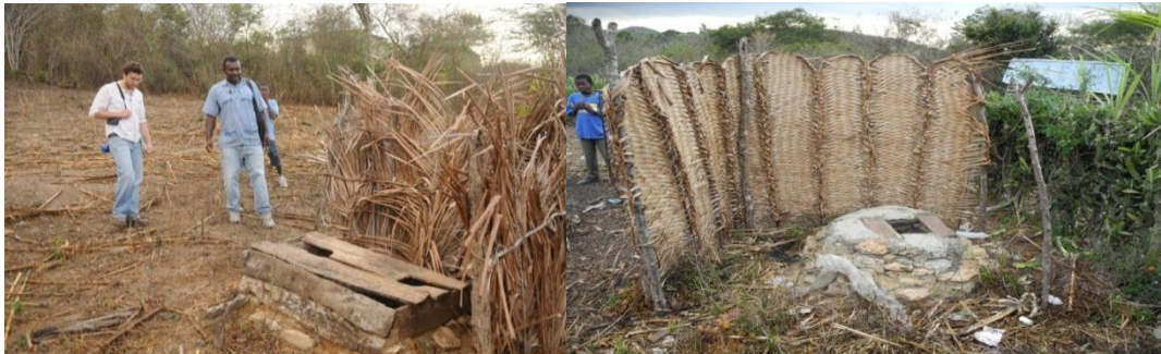
Ben Castleberry and Gabriel Thelus assess the current latrines in Jacsonville, which do not meet WHO standards.

Last March, Sante Total conducted a site assessment of the sanitation infrastructure within Jacsonville. Currently, 58 households lack access to latrines or other means to enclose defecation and contain harmful bacteria, such as E. coli . Another 44 household are using latrines that are inadequate by the World Health Organization (WHO) and also are unsafe to use. Sante Total will begin latrine construction at individual households during the upcoming December trip. The preliminary cost per latrine is estimated at $175. A goal of the December medical trip is to teach local community members the proper methods and practices to build latrines to WHO standards.