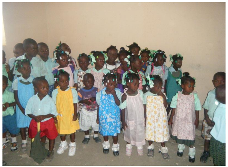
Students of St. Rose de Lima School in Jacsonville, Haiti, wear clothing made by members of Cross Roads Presbyterian Church.