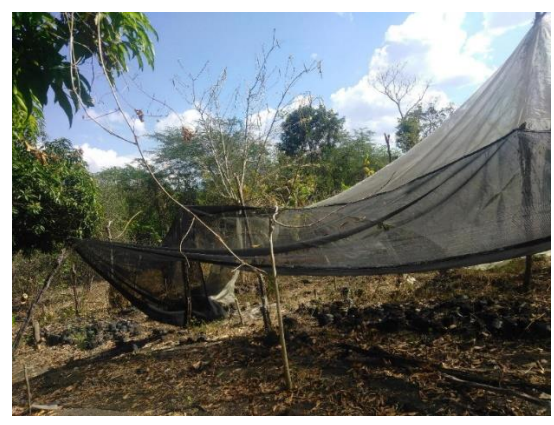
The site of the nursery

In January of 2019, Fanfan set up a trip to visit with Gaby and provide a report on the status of the project in Jacsonville.