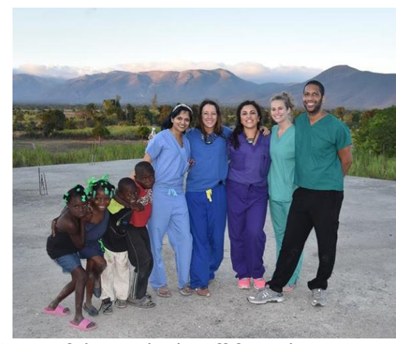
Some of the medical staff from the January trip with Jacsonville children.