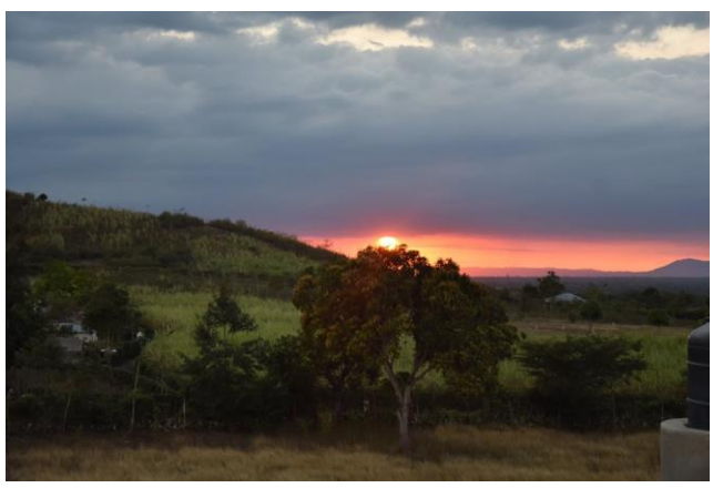
One of the many beautiful sunsets in Jacsonville

Sante Total, which means "Total Health" in Haitian Kreyol, aims to provide sustainable healthcare to rural communities in the Central Plateau region of Haiti. We believe you can only improve health through eradicating the disease of poverty. The Sante Total approach considers the entire person- physical health, well-being, education, and employment, to be essential to health and quality of life.