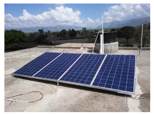
Solar panels on the roof of the mission house

were installed, and tree seedlings were planted in the field with the help of the school children.