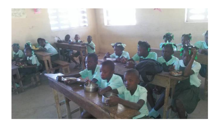
"V" is for Vision

Please contact us if you would like to help sponsor the school lunch program. The grant we have received only covers a portion of the cost of the program, and we would like to expand so that we can provide lunch on a daily basis.